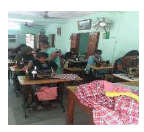
Programmes: Basic instructions are given in –